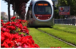
KAYSERAY HAFIF RAYLI SİSTEM 17KM REFÜJ ALANI SATALLITE SULAMA SİSTEMİ UYGULAMASI 2008-2009